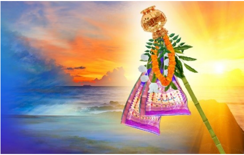
Sri Ram Navami Festival and Chaitra Navratri

Vasanta or Chaitra Navaratri: This Navaratri is celebrated during the Shukla Paksha of Chaitra, which is between March to April. The beginning of this Navaratri also marks the start of the New Year as per Hindu Lunar Calendar. Maharastrians celebrate the first day this Navaratri as GudiPadwa. Ninth day of this festival people celebrate the birthday of Lord Shri Rama as "RamaNavami". This Navaratri is mostly celebrated in North India and Western India.